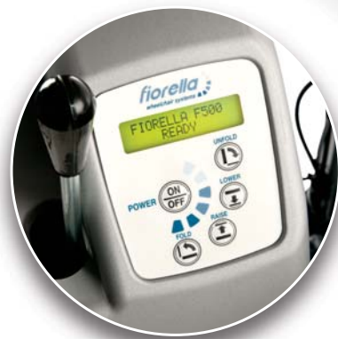
● Multi-language LCD interface