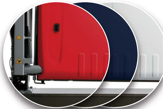
● Platform covers are color customizable