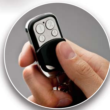
● Remote control with sliding cover to protect controls with an elegant chrome finish